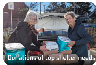
Donations of top shelter needs