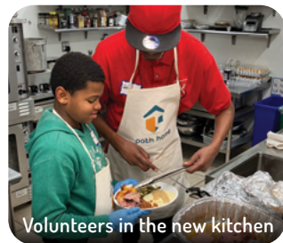
Volunteers in the new kitchen