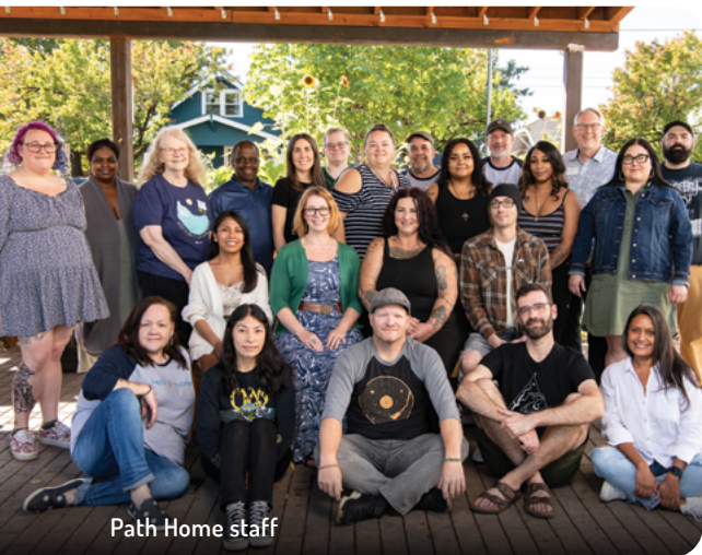
Path Home staff